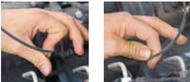
Flex & Twist feature